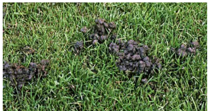
>> Figure 2: Humified worm casts.

Humus is biologically active. Binding of humus by minerals and clay and to other soil particles within aggregates reduces its accessibility to soil organisms responsible for degradation. As a result of this protection, degradation of humus is slow unless exposed through cultivation.