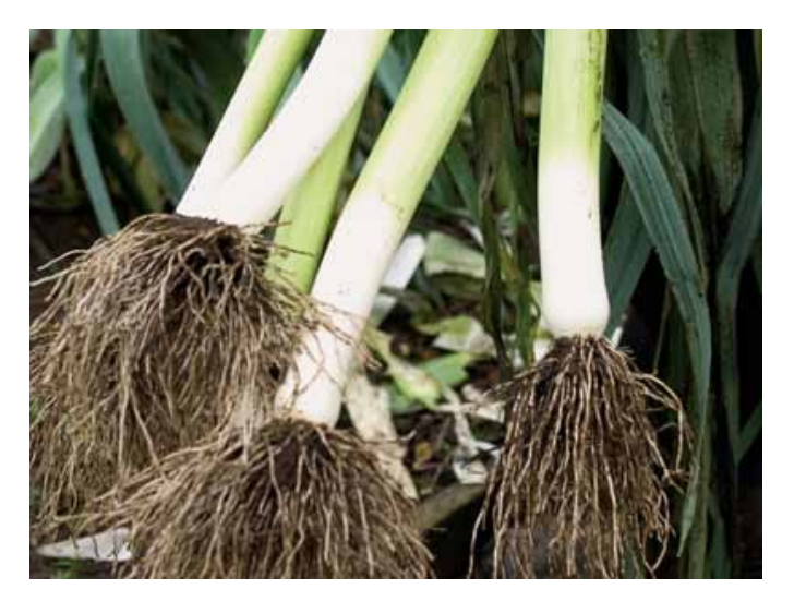
^ Figure 2: Soil with good structure and function enabled these leeks to grow healthy root systems and produce a high yielding crop

Open, interconnected pore spaces also allow ready movement of air into the soil enabling oxygen to be renewed and waste gases such as carbon dioxide to be removed.